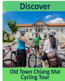
Old Town Chiang Mai Cycling Tour