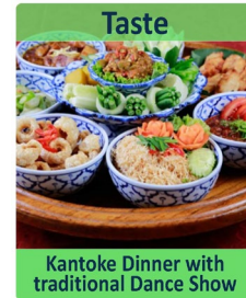
Kantoke Dinner with traditional Dance Show